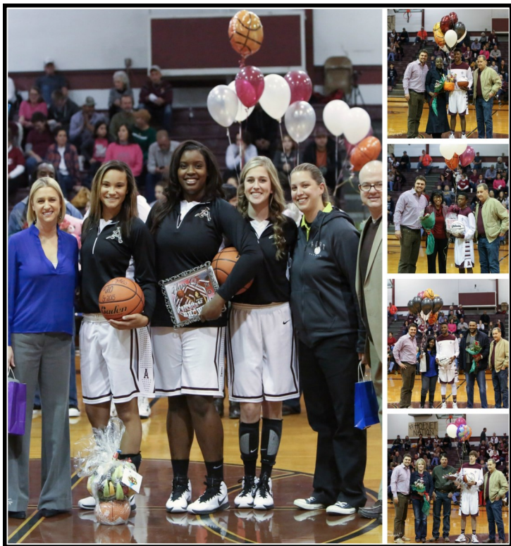
Senior Basketball Players Celebrate Senior Night